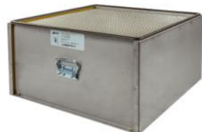
5 TH STAGE 'HF' HEPA FILTER 95% 2000HF-2095 99.97% 2000HF-2099 Odor-Rid 2000HF-3095