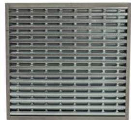
1 ST STAGE MECHANICAL ELEMENT A11FMS-0001