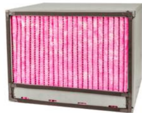
4 TH STAGE "OM#7" OIL MIST FIBRE BED FILTER A11FOM-0007