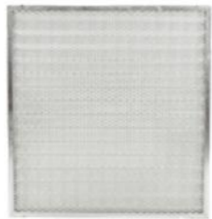
2 ND STAGE DEMISTER ELEMENT A11FDE-0002