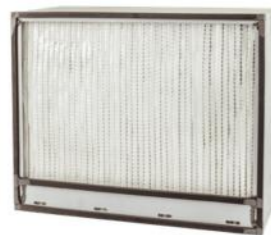
3 RD STAGE "OM#5" OIL MIST FIBRE BED FILTER A11FOM-0005