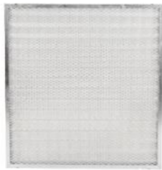
2 ND STAGE DEMISTER ELEMENT A11FDE-0002