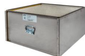
5 TH STAGE "HF" HEPA FILTER 95% 2000HF-2095 99.97% 2000HF-2099 Odor-Rid 2000HF-3095