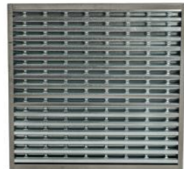
1 ST STAGE MECHANICAL ELEMENT A11FMS-0001