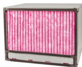
4 TH STAGE "OM#7" OIL MIST FIBRE BED FILTER A11FOM-0007