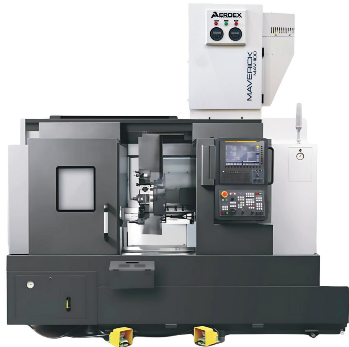
Example of a Direct Mount.

Choose the mounting style that best fits your space and operational goals. By aligning your selection with your facility's layout and workflow, you'll optimize mist collection efficiency while keeping production running smoothly.