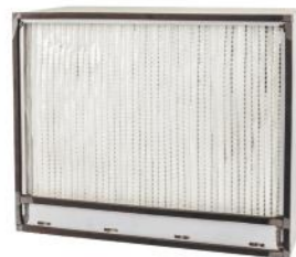
3 RD STAGE "OM#5" OIL MIST FIBRE BED FILTER A11FOM-0005